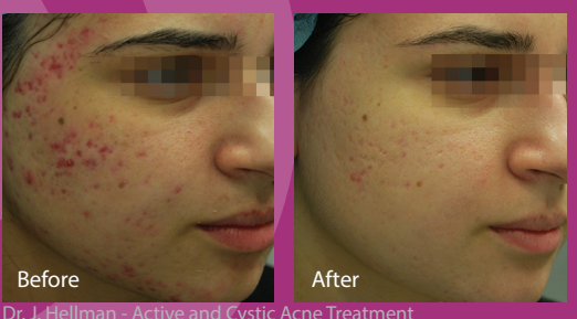
Significant reare and Signification reasonable